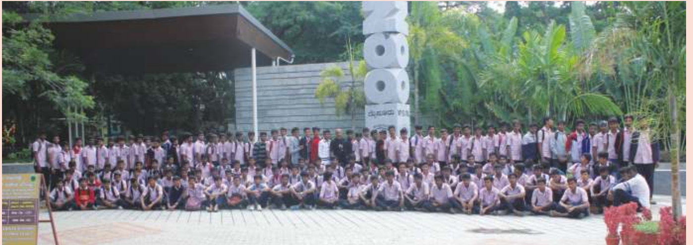
Maharaja PU College Mysuru