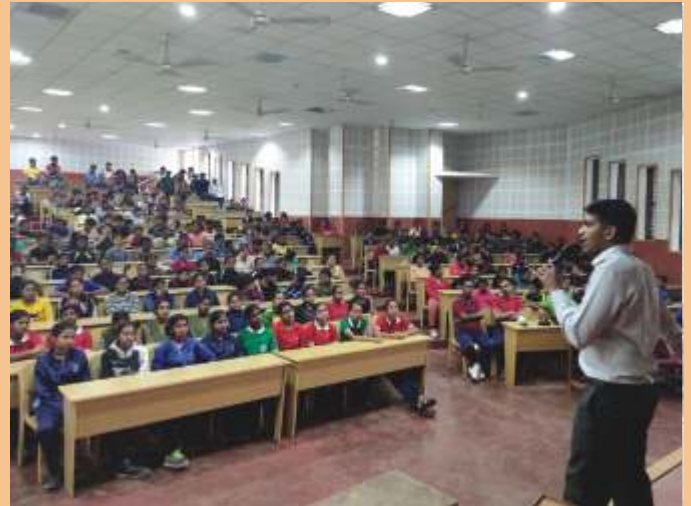
Zoo outreach program at KSOU Mysuru