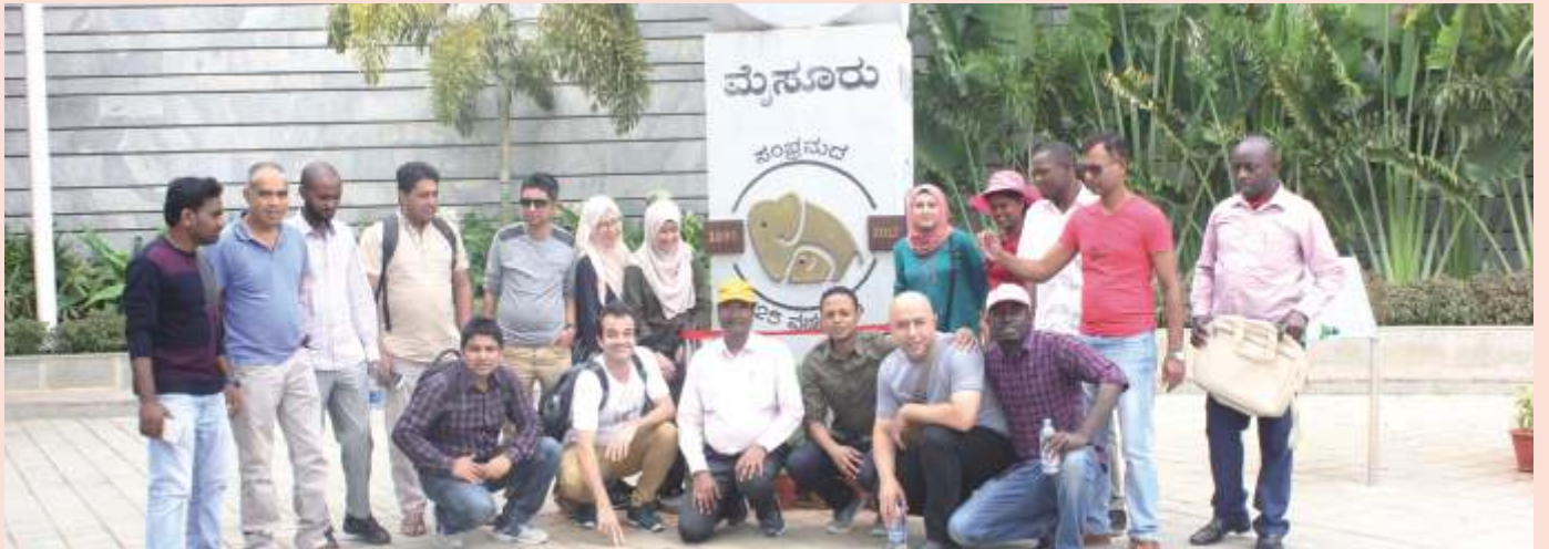
ATI trainee officers from NIRD & PR, Hyderabad