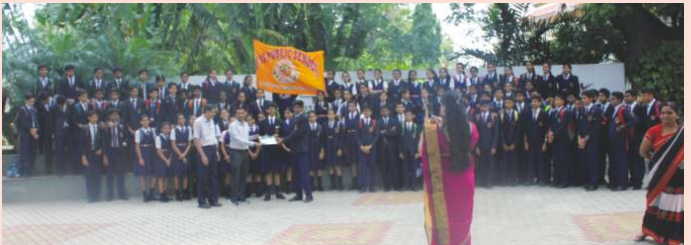
JSS Public School Siddharthnagar Mysore