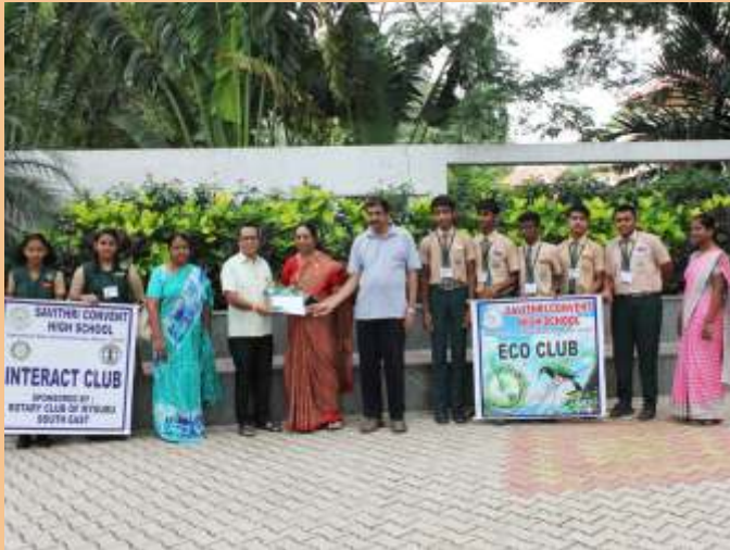
Savithri Convent, Mysuru